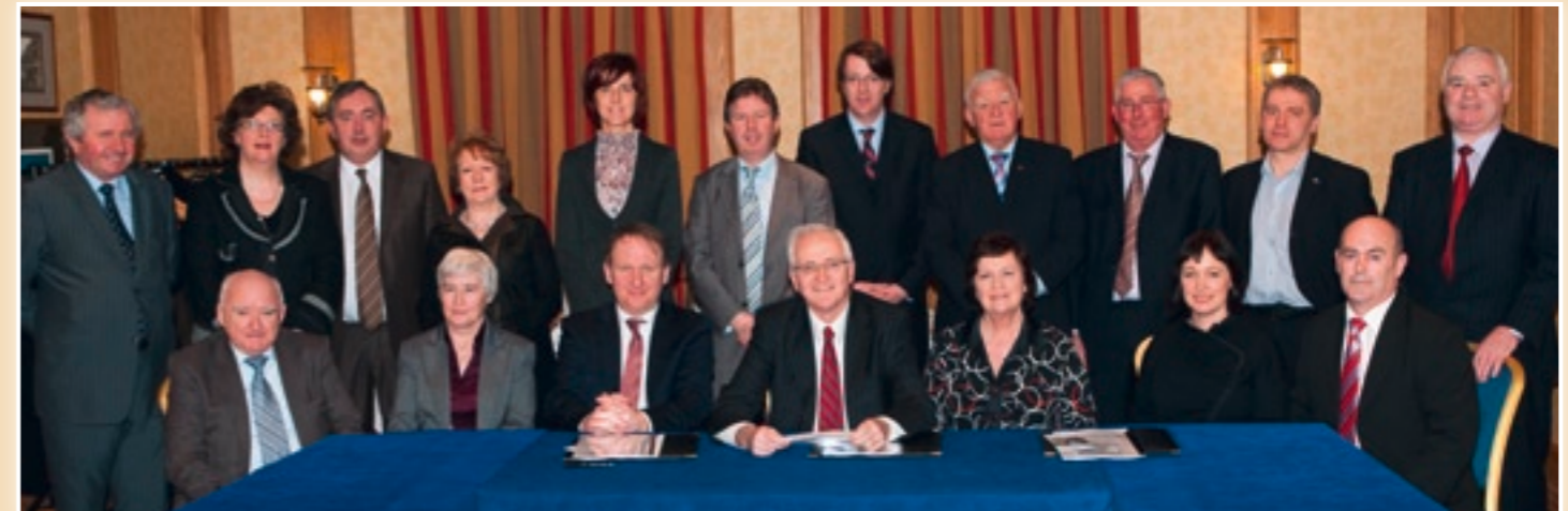
Mr. John Gormley T.D. Minister for the Environment, Heritage and Local Govt. with members of the Irish CoR Delegation

Committee of the Regions begins new five-year term